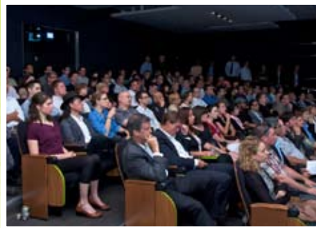
Your audience, our Members