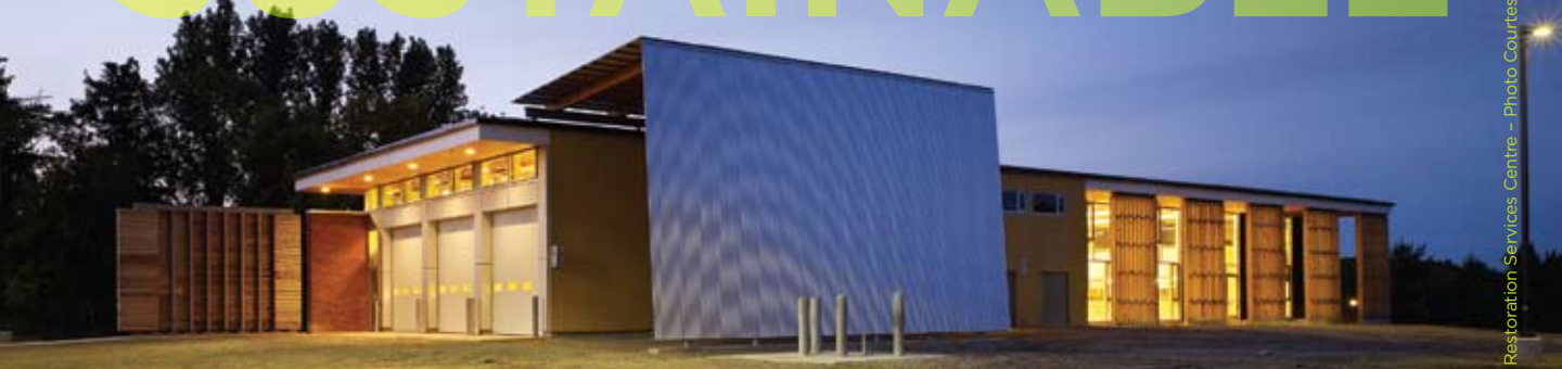
Restoration Services Centre